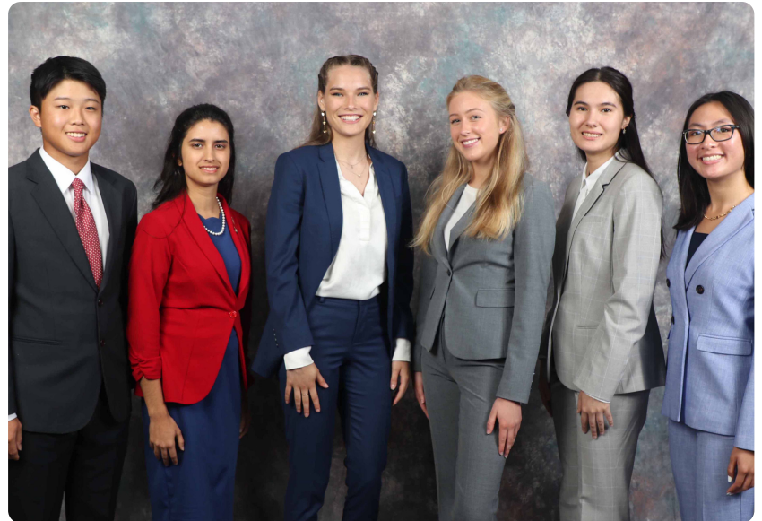
2023 Joseph S. Rumbaugh Historical Oration Contest Finalists