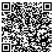
Electronic Flag Booklet

Display your American flag with confidence with the Sons of the American Revolution's newest online resource Long May She Wave: History & Etiquette of the American Flag . This guide provides vital information needed to display the American Flag properly in any scenario. It offers approved guidelines on days of observance, placement, history, care, and appropriate opportunities to fly America's colors. Schools, color guards, scouting groups, public and private organizations will find this a go-to reference.